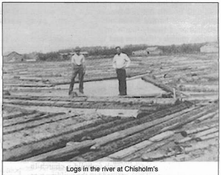
Logs in the river at Chisholm's

Monthly meetings are held in the Auditorium of the Quinte Living Centre 370 Front Street, Belleville