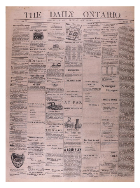
The Daily Ontario front page, 1 September 1879

Fun fact about Leah: her favourite animal is the penguin!