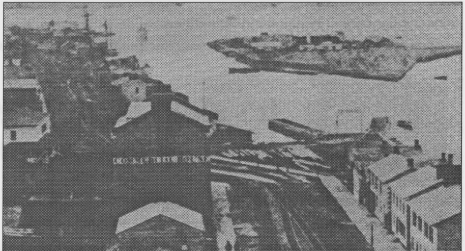
The Belleville waterfront from the north (probably the city hall tower) circa 1880. The island in the top right, now Victoria Park, was the site of saw mills for many years. Sawdust generated by the cutting of lumber was used to build the road which now connects the island to the shore.

But back to Alexander Cuthbert. His first entry in the America's Cup race had been the Countess of Dufferin in 1876. Then in 1881, he challenged the New York yacht club again with the Atalanta . The boat was still unfinished when they started down to New York, building it as they went. Because of its con-