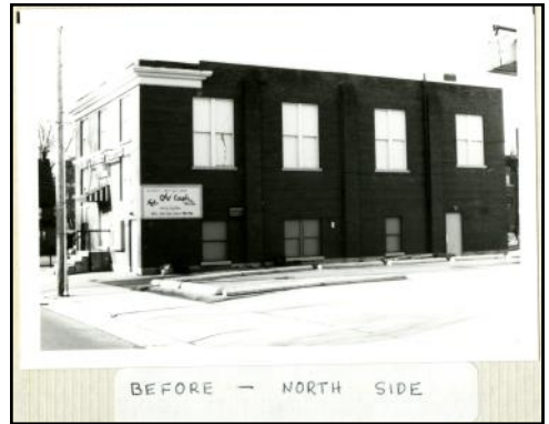
CABHC: Daily Intelligencer 7 March 1969