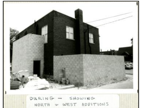
CABHC: 2022-064/1/13 Photographs from a scrapbook relating to theatre renovations in 1983