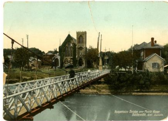
Valentine & Sons 'Giant' postcard showing the original suspension footbridge, commissioned in 1873 and built in 1874, c.1910

The Community Archives will be taking part in Belleville's Doors Open event on Saturday September 17th from 10 to 4. Call in to see our exhibit on the history of the pedestrian crossing across the Moira river, soon to reopen with a new bridge. And bring any questions you may have about the archives and our collections for the archivist!