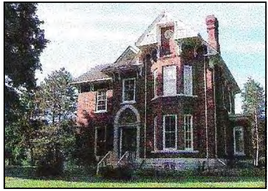
Allison House Museum and Archives, Adolphustown

David Allison was the grandson of Loyalist settlers. After making his fortune in iron and timber in the United States during the nineteenth century he returned to his birthplace in Adolphustown and built Allison House during the winter of 1877. The house is now the United Empire Loyalist Heritage Centre museum and archives. The Centre underwent major