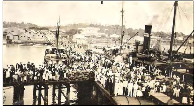
The Kilties' welcome at Suva, Fiji, August 3, 1908