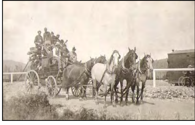
Ready for the Buller Gorge Trip, New Zealand