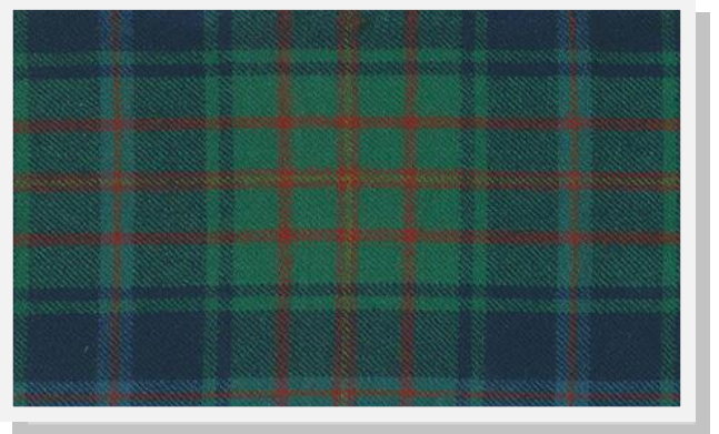
CABHC: TR 0062 Sample of Bay of Quinte tartan, designed by Alex Wilson and produced by Trenton Dyeing and Finishing, 1967

These files contain a wide variety of materials, ranging from a summons in a case of high treason during the 1837 Rebellion in Upper Canada, to a sample of Bay of Quinte tartan dating from 1967.