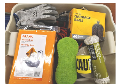
CABHC disaster kit