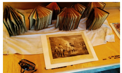
Wet items drying out

In June, neighbouring Northumberland County Archives organized a very hands-on training session on managing disasters and mould with conservator, Kyla Ubbink. The Community Archives now has its own disaster kit, including essential supplies such as blotting paper, polythene sheeting and a mop and bucket!