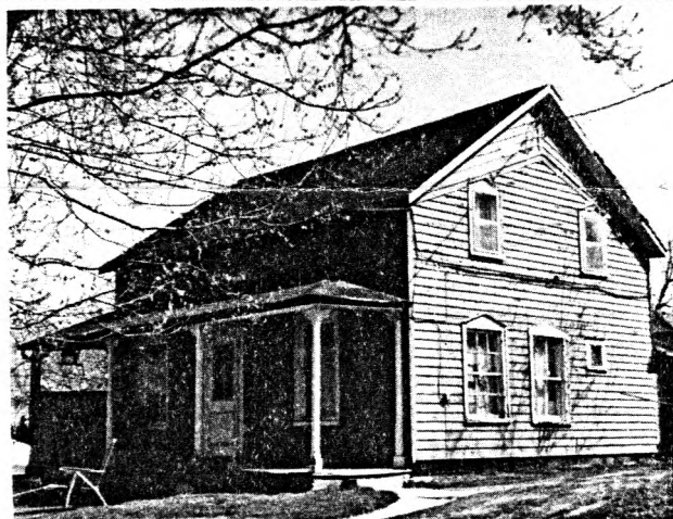
THE MCCURDY COTTAGE 307 Church Street

About 8:45 P.M. the books will go on sale at a special price of $2, there'll be a heritage cake to share, and strawberries and dip. Committee members will be available to autograph the books.