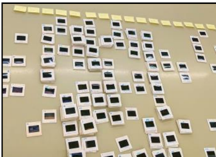
CABHC: 2022-071/9 Slides during sorting

The initial sorting process took several days, and created some impressively tall piles of slides on the reading room map cabinets.