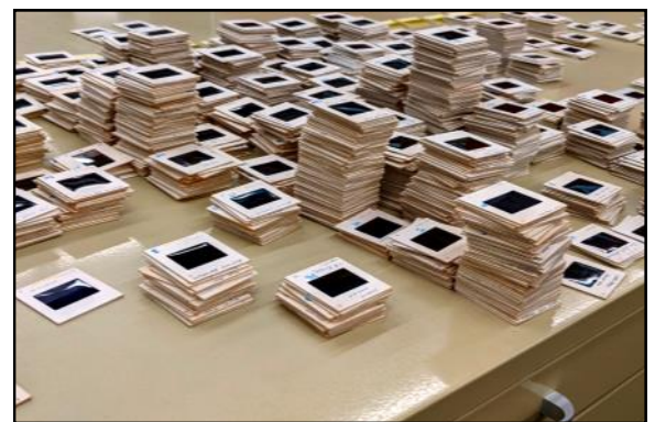
CABHC: 2022-071/9 Sorted slides in piles

parks such as Zwick's and the Corby Rose Garden, while others document park construction projects. There are also a number of aerial photographs of Belleville and several slides of Santa Claus parades in Toronto (1965) and Belleville (1972). We plan to share some of the slides online and in a future newsletter.