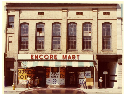
Photograph commissioned by Heritage Belleville, c.1977

Our thanks to the roving photographers for their work in recording and sharing this restoration process!