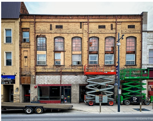
232 Front Street, 24 April 2021

In the first picture here, taken in the morning of 24 April, half of the steel cladding formerly covering the building has been removed. By the time of the second photograph, taken in the afternoon of the same day, all of the building's original windows and details have been revealed.