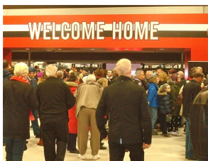
CABHC: 2019-009/1 First Belleville Senators' home game, 2017

2020-048 Records of Ontario Business College, 1883-1997