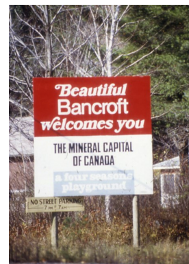
CABHC: 2014-52/95 Welcome sign at Bancroft, 1985