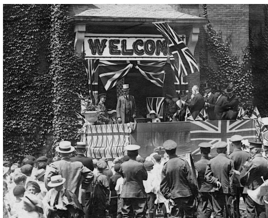
CABHC: HC01047 Dignitaries welcome the Governor General, Victor Cavendish, to Belleville, 14 June 1919

This month's display is on the theme of 'Welcome!', to celebrate the reopening of the Community Archives. We are looking forward to welcoming everybody back!