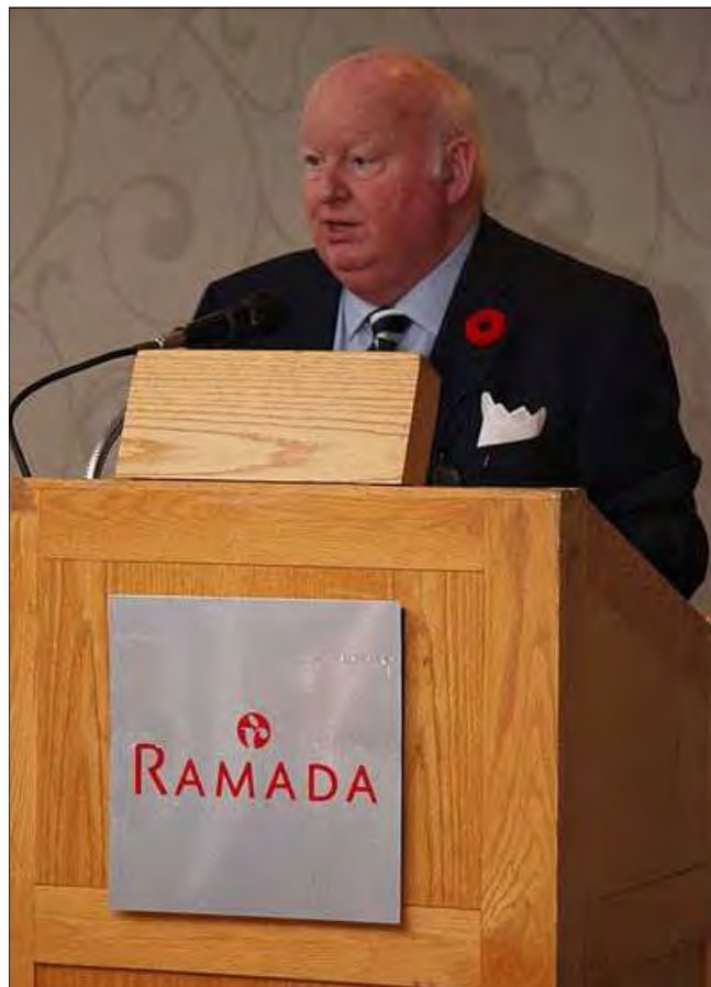
Senator Mike Duffy: "There is a market for history."