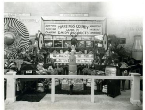
CABHC: HC01556 Hastings County dairy display at a trade fair, c.1930