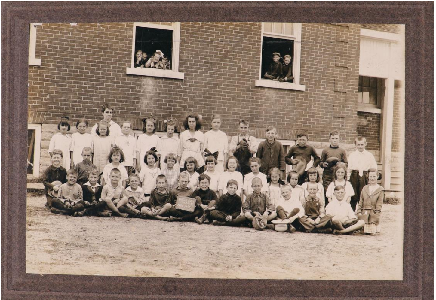
Photograph of class at Victoria School in Tweed, 1920