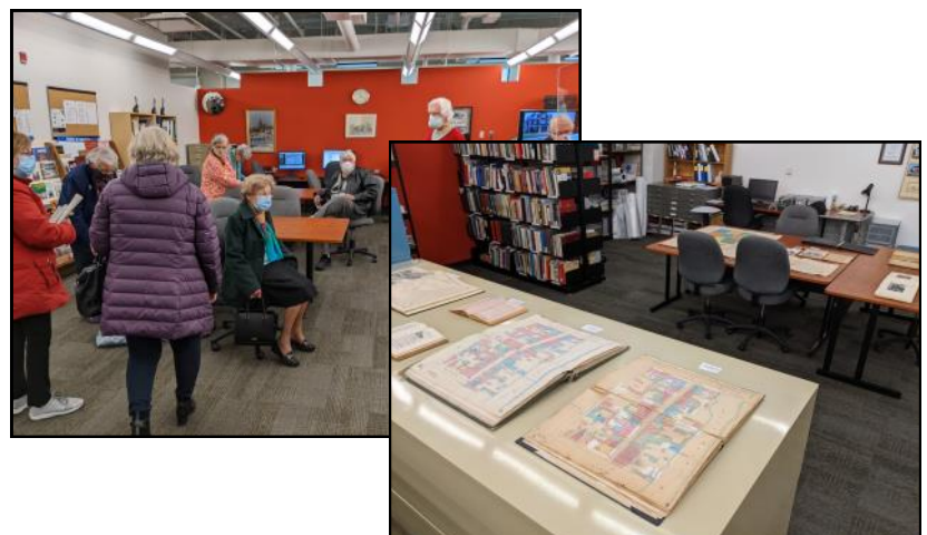
Members of the Probus Club of Belleville visited the Community Archives on 31 March 2022

It was a pleasure to display some of the records held here at the archives and to be able to share their stories with the visitors.