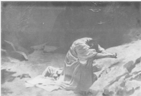
The Man of Sorrow

Early in 1792 the congregation at Hay Bay (beginning in Paul Huff's house) prepared for the building of a church. The present Hay Bay Church was the first Methodist Church in Upper Canada (Ontario).