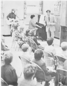
"To Sing and make Melody" — Church School, Sept. 1974