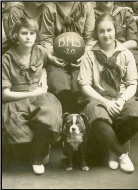
CABHC: HC04606 Belleville High School basketball team with Muggins (detail), 1920

There are at least five photographs from the early 1920s in the Community Archives' collection which feature the same bulldog. Usually he appears as the mascot of some sports team or other, and in only one of the photographs is he identified by name. That name is Muggins.