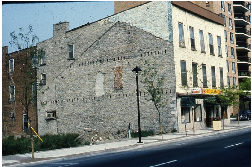
CABHC: 2021-023-161 Hotel Belvedere at 360 Front Street, Belleville, c.1987

Have you ever noticed the traces left behind by old buildings on existing ones? This recently-digitized slide of the former Belvedere Hotel on Front Street in Belleville is a good example of this phenomenon, with the clear outline of another building imprinted on the south wall of the hotel.