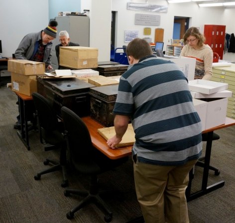
Volunteers unpacking the Parker materials

It has been a little like Christmas here in the Community Archives over the last week, as we have been busy sorting through a large shipment of records received from the family of Sir Gilbert Parker.