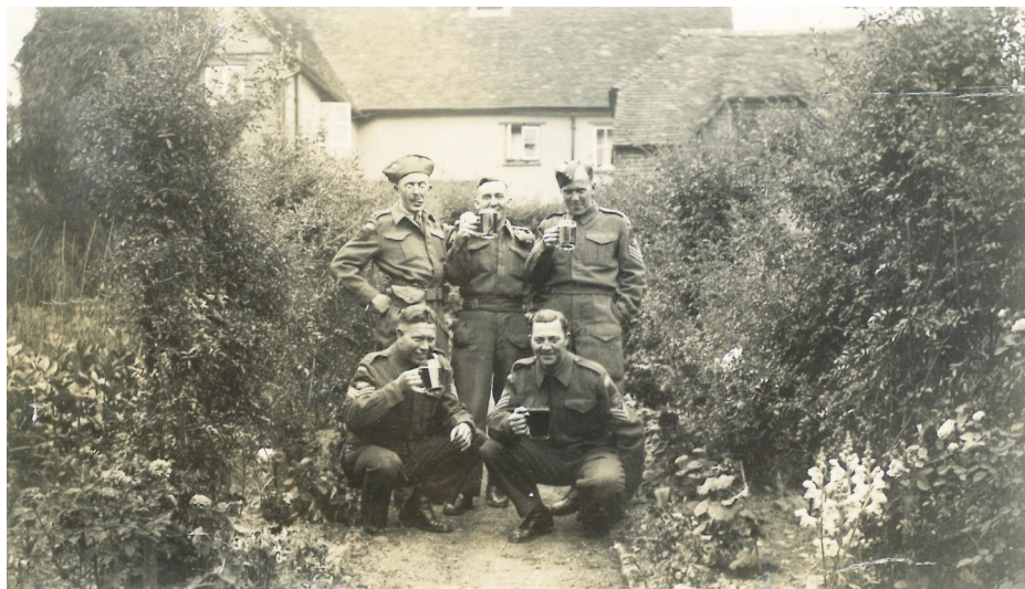
CABHC: 2020-034-08 Group of soldiers relaxing with drinks, c.1940

In April, the Community Archives received a new collection which was made up entirely of scanned photographs.