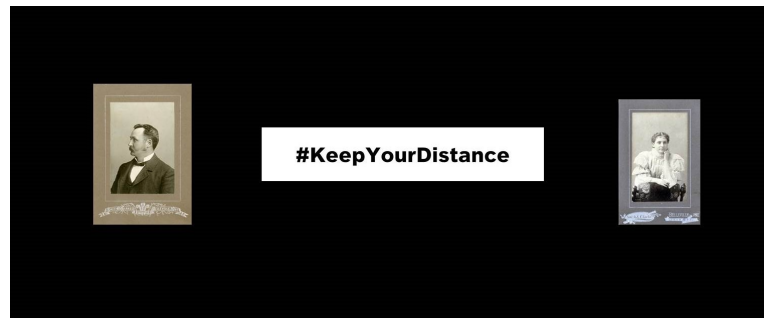
CABHC: HC07261 and CABHC: HC05567 Photographs of an unknown man and woman, taken by Smith and Clarke of Belleville, c.1895

This month's display is ... well, rather unsurprisingly, it's exactly the same as last month's one. Here's hoping that we will be able to update it some time soon. In the meantime, we hope you are staying safe and well.