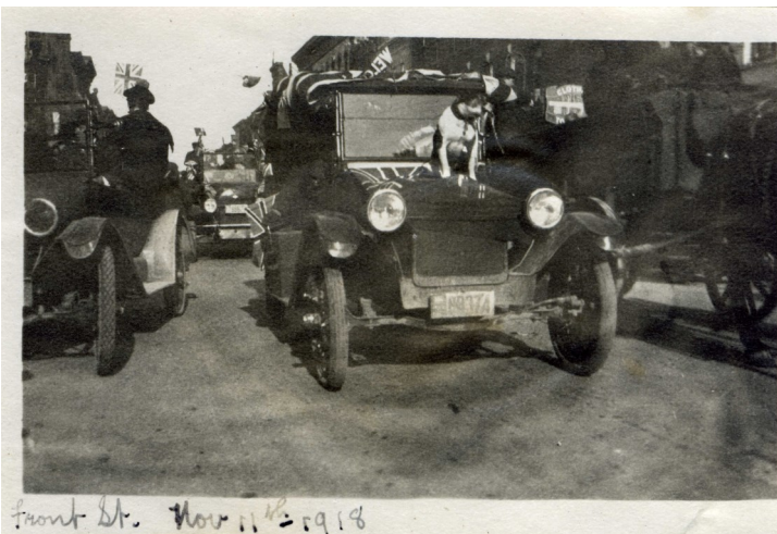
Front St. Nov 11 th 1918