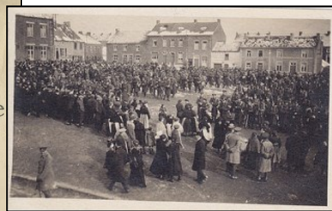
Canadian Expeditionary Force soldiers assembling in Ham-sur-Sambre in Belgium for the return to England, December 1918.