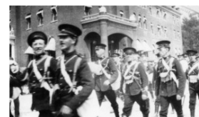
Men of the 15th Regiment pictured in front of the Hotel Quinte, Belleville leaving for Valcartier