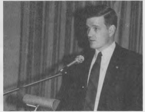
From A Reliable Keyhole...