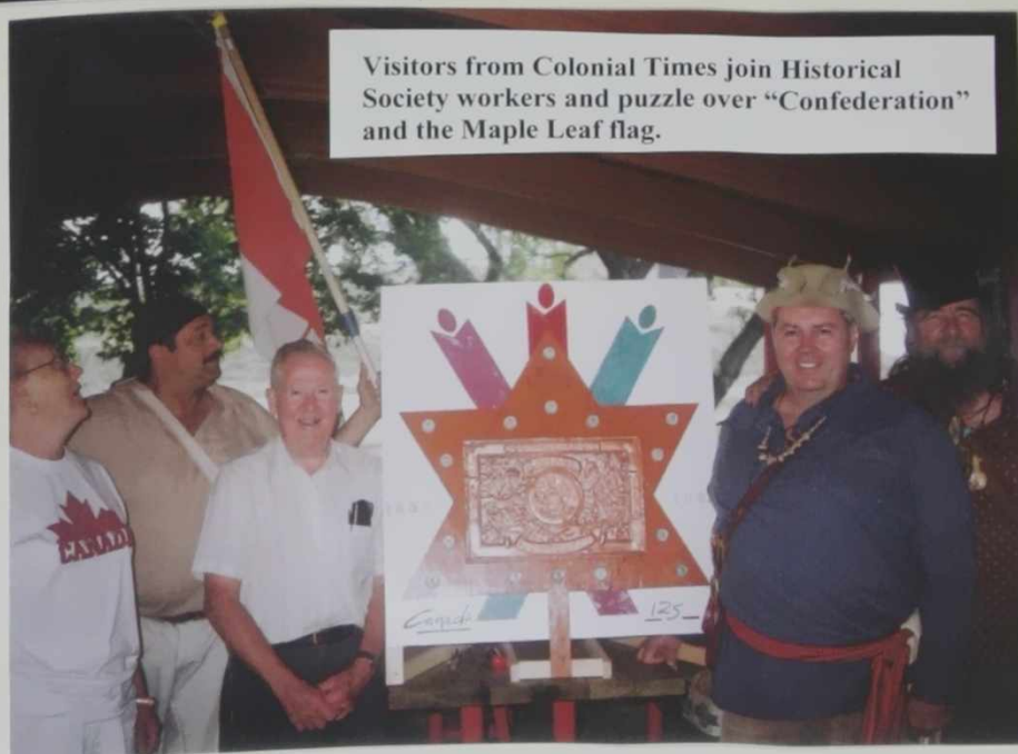
Visitors from Colonial Times join Historical Society workers and puzzle over "Confederation" and the Maple Leaf flag.