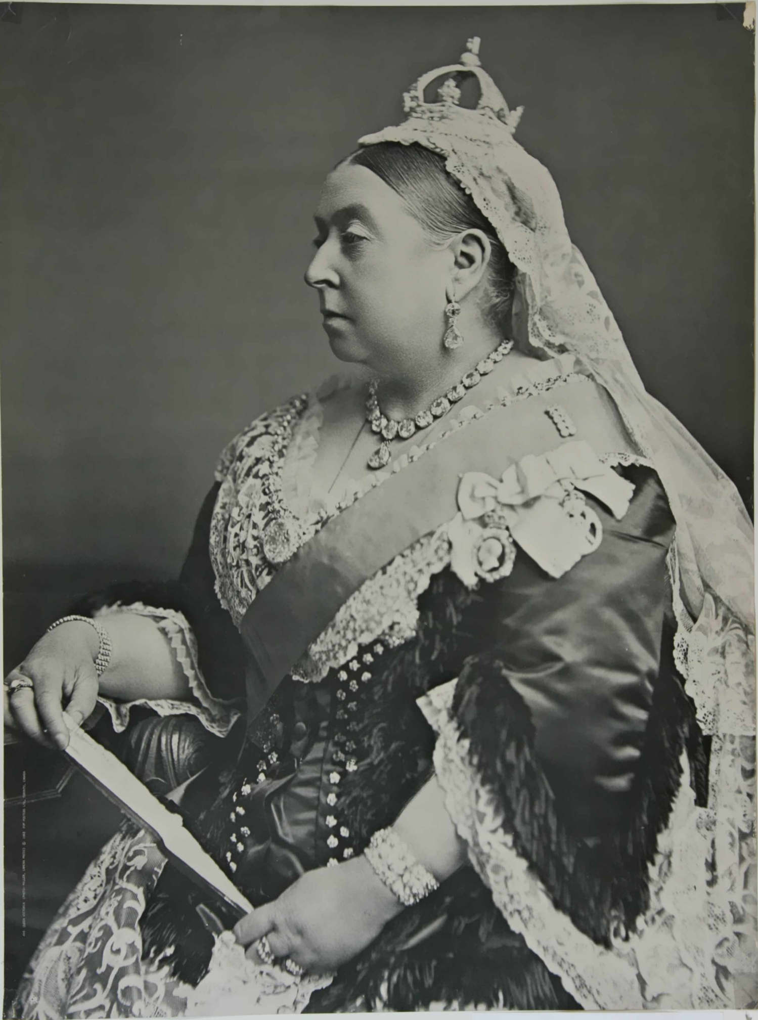
The Queen of Canada at the time that the Dominion of Canada was created.