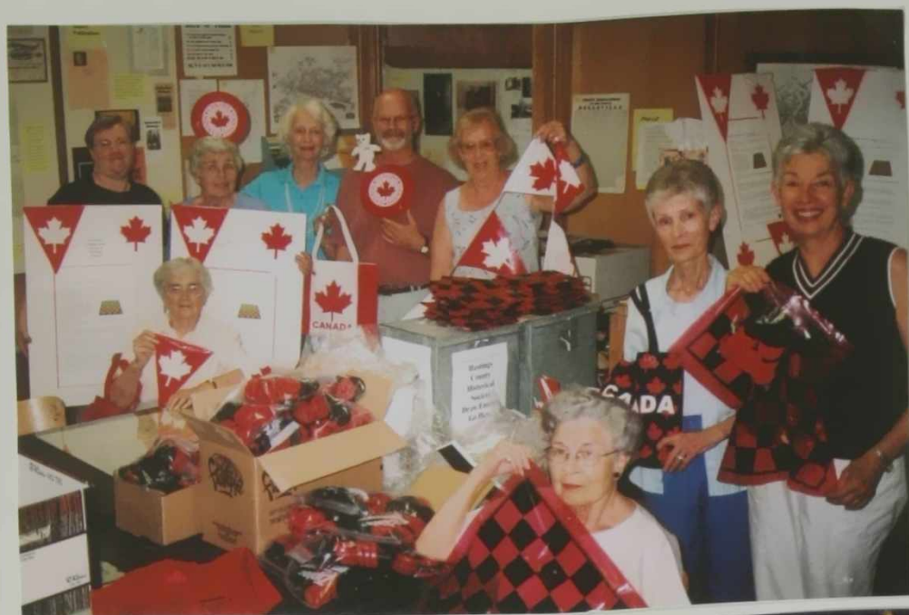
Some of the 24 Society volunteers who helped prepare and staff the Canada Day event. Here, a few days before the event, they are getting materials ready in the Society's headquarters in the Hastings Heritage Centre (formerly the Thurlow Town Hall) in Cannifton.

The Hastings County Historical Society hosted the Canadian Confederation Checkers Challenge Competition (with 50 Checker boards and hundreds of participants), historical displays, and a Picture Identification Clinic