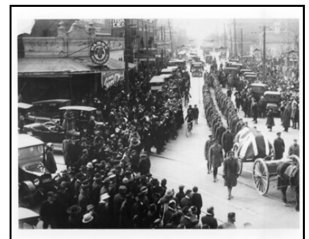
Vernon Castle's funeral procession in Fort Worth, 16 February 1918

The images also include a photograph of Captain Vernon Castle (1887-1918), a ballroom-dancing movie star who served as a pilot and a pilot-trainer in the war. Castle was killed in a flying accident on 15 February 1918. There are also photographs of his funeral procession.