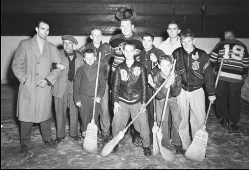
A member of the Chicago Black Hawks team