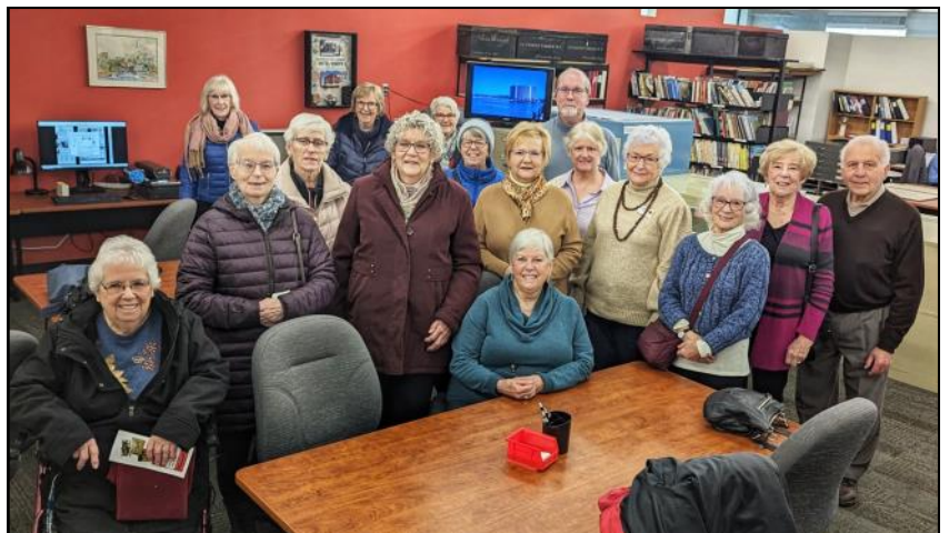
Visitors from the Probus Club of Quinte, 11 January 2024

If you are involved with a Belleville or Hastings County community group who would like to take part in a similar tour, please contact us. Tours are free of charge.