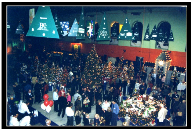
CABHC: 2021-047/7/16/1 Festival of Trees, c.2000

showcases of visual arts, music, dance, writing and theatre in the area. A large portion of the collection contains records relating to events organized by the Council.